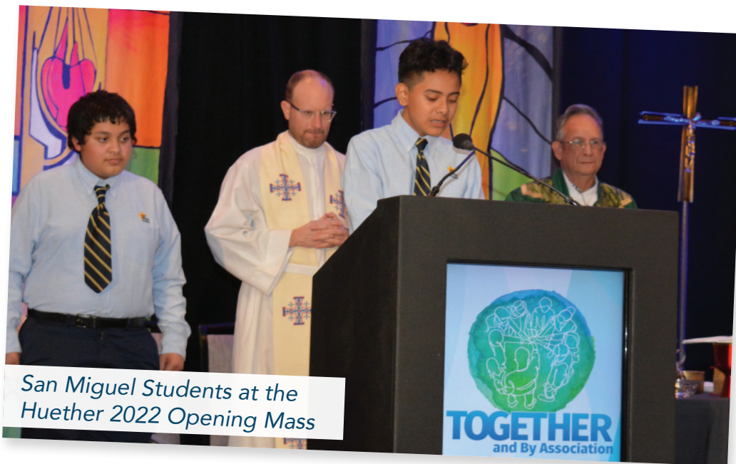
San Miguel Students at the Huether 2022 Opening Mass